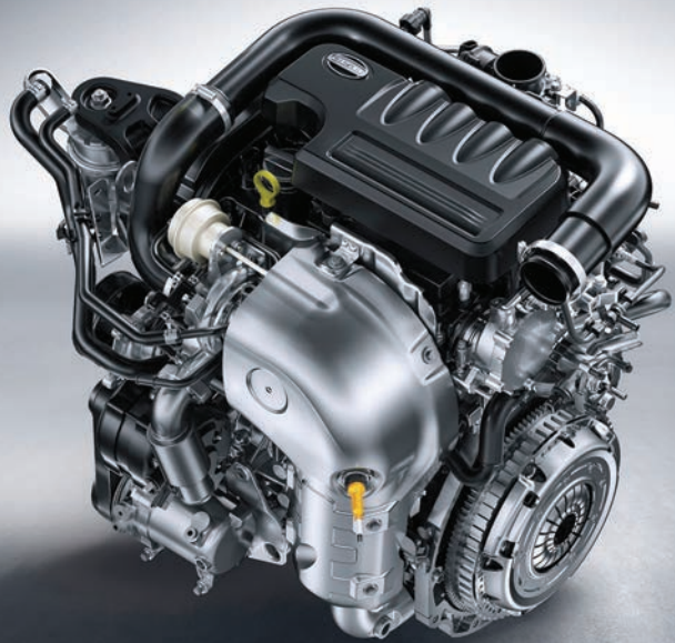
1.3T TURBOCHARGE ENGINE