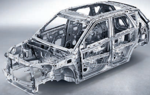
FULL METAL BODY